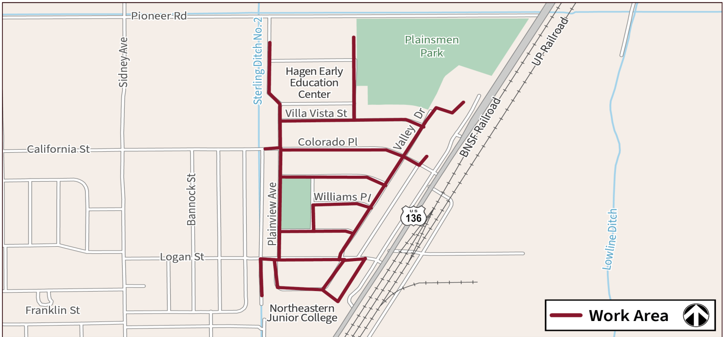
This map is a graphic and may not show exact locations.